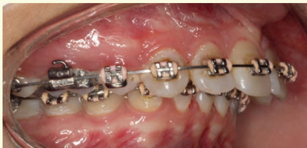
Examples of how teeth bite just before surgery.